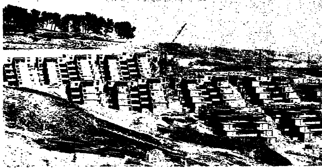
The Gad Construction Company's project on French Hill in Jerusalem, consisting of 540 apartments, is architecturally integrated with the slope of the land.